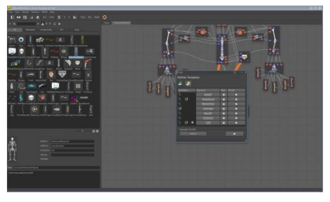
Figure 2. BlockParty 2 User-Interface. Left: Library of available blocks. Right: In-place signpost assignment panel.

Since Lucasfilm produces so many rigs, it is important that the rigging interface for BP2 be intuitive for riggers and non-riggers. So, unlike other procedural rigging systems, rigging in BP2 is achieved via a visual, 2D interface. The UI allows users to easily instantiate blocks by dragging them from a block library onto a canvas and connecting them visually (see Figure 1). A user modifies settings in-place for each block by expanding the block's visual representation in the UI; this expanded view of a block includes several task-specific panels. For instance, one panel allows a user to assign required signposts for a block to existing nodes in the Maya scene; the panel can also import a template for all of the required signposts that can be resized/repositioned in the 3D view using Maya's normal transformation tools (see Figure 2). This visual approach to procedural rigging allows riggers of all skill levels to spend more time conceptually designing a rig and less time navigating nodes in the Maya scene or scripting.